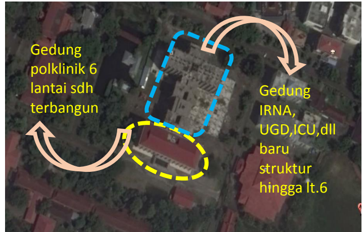
Figure 2 Location of Sam Ratulangi University

Now, the progress of its teaching hospital is 30%