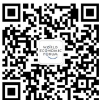
Wechat (达沃斯 Davos)