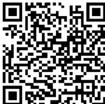
Sina Weibo (@达沃斯 Davos)