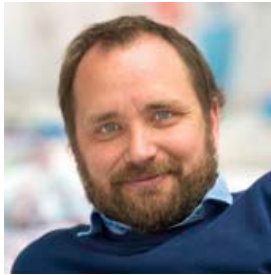
Tomás Saraceno, In and beyond planet Earth