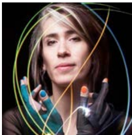
Imogen Heap, London