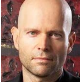
Marc Forster, Los Angeles

Marc Forster is a filmmaker and screenwriter, best known for directing the films Monster's Ball , Finding Neverland , Quantum of Solace , and others. He has worked with the Red Cross organization Our World, Your Move, as well as with Rokpa International, which helps the hungry, sick, orphaned and poor in Tibet and Nepal.