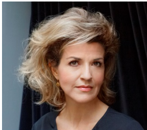
Anne-Sophie Mutter, Munich