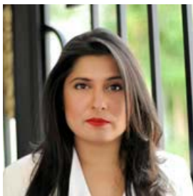
Sharmeen Obaid-Chinoy, Karachi

Anne-Sophie Mutter is among the greatest violinists of our time. After her debut at the age of thirteen at the Lucerne Festival, she has performed concerts in all the major music centres. She is committed to supporting young, talented musicians worldwide through her foundation, which provides scholarships for musicians to fulfil their dreams of developing a professional career in music. She is one of the recipients of the 2017 Crystal Award.