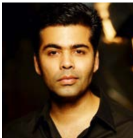
Karan Johar, Mumbai

Jin Xing is a TV talk show host and one of China's most influential opinion-makers. She is a trained dancer, choreographer and owner of the Jin Xing Dance Theatre in Shanghai, the country's first independent dance company. Jin was the first transgender person in China to receive the government's approval to undergo gender reassignment.