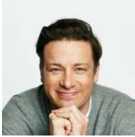
Jamie Oliver, London

Jamie Oliver is a renowned chef and restaurateur. He has long been the face of the United Kingdom's campaign to bring radical change to the school meals system by replacing unhealthy food with nutritious substitutes. Oliver is also a patron of the environmental charity, Trees for Cities.