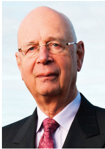
Klaus Schwab, Founder and Executive Chairman, World Economic Forum

We are pleased to present this White Paper examining the practical implications of stakeholder capitalism for corporate governance and Boards of Directors in particular.