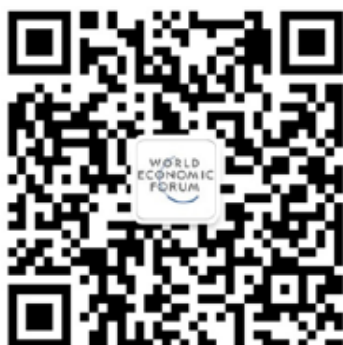
Wechat (达沃斯 Davos)