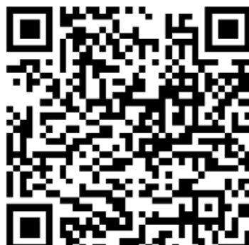
Sina Weibo (@达沃斯 Davos)