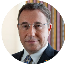
Achim Steiner Administrator, United Nations Development Programme & Co-Chair, Global Future Council on Economics of Equitable Transition

The green transition, driven by a rising urgency of accelerated climate action, is a transformative economic shift that impacts the production, distribution and consumption of goods and services with far-reaching and complex implications on equity, fairness and justice. Achieving net zero will encompass a wide range of changes: a clean energy system; the greening of agriculture, mobility and heavy industry; sustainable cities and infrastructure; and the scaleup of circularity models.