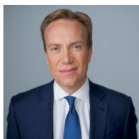
Borge Brende – President

Expertise: public-private partnerships, global risks