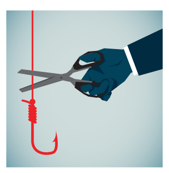
Tenet 5 Protect Your Email Domain Against Phishing