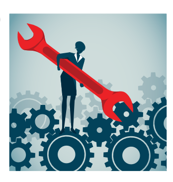
Tenet 9 Build a Robust Disaster-Recovery Plan for Cyberattacks