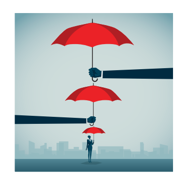
Tenet 6 Apply a Zero-Trust Approach to Securing Your Supply Chain