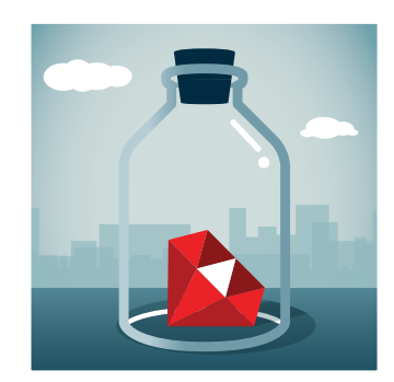
Tenet 4 Protect Access to Mission-Critical Assets