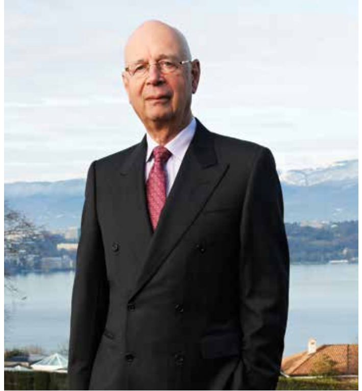
Professor Klaus Schwab Founder and Executive Chairman

The World Economic Forum engages political, business, academic and other leaders of society in collaborative efforts to shape global, regional and industry agendas. Together with other stakeholders, it works to define challenges, solutions and actions, always in the spirit of global citizenship.